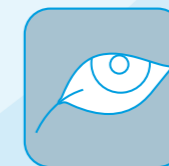
HUMAN & ECOSYSTEM HEALTH