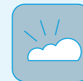
ENERGY & ATMOSPHERE